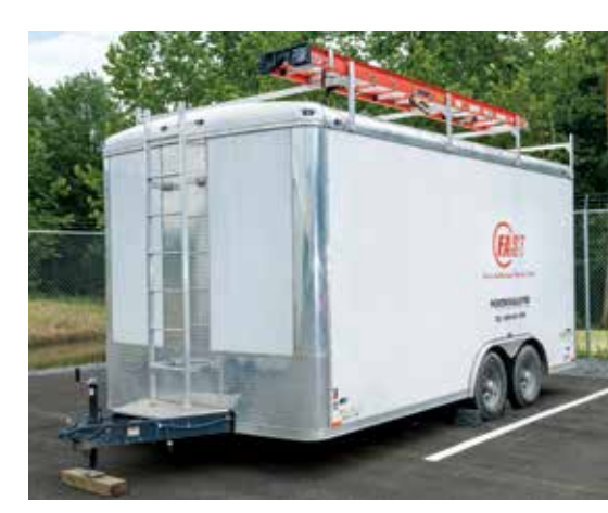
FAST mobile repair unit